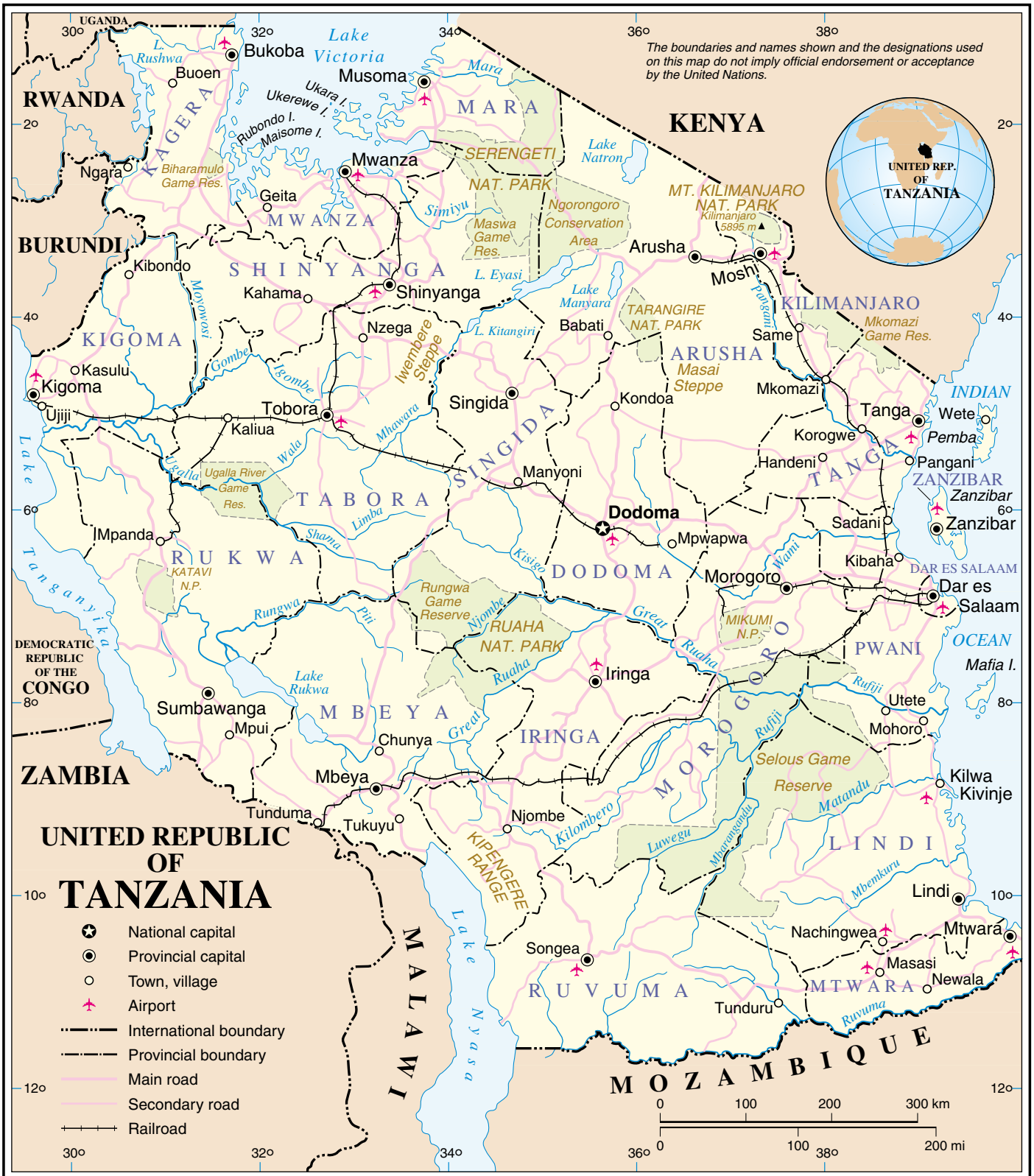
Map No. 3667 Rev. 6 UNITED NATIONS January 2006

Department of Peacekeeping Operations Cartographic Section