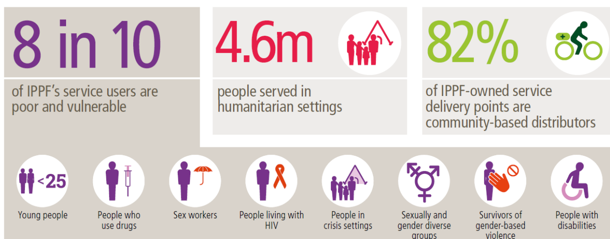
Figure 1: IPPF Annual Performance Report 2019

Established in 1952 in India, IPPF today is a worldwide movement of 132 national Member Associations (MAs) – as well as 28 collaborative partners covering 164 countries in total with close to 32,000 staff. The MAs have long-standing relationships with governments and a core mandate to reach underserved communities. In 2019, more than 80 pct. of all of IPPF's clients were from either poor or underserved populations. Of the total core funding, 45 percent was allocated to the African region followed by 16 percent to South Asia. Denmark will continue to work for a strong focus on Africa in line with Danish geographical priorities.