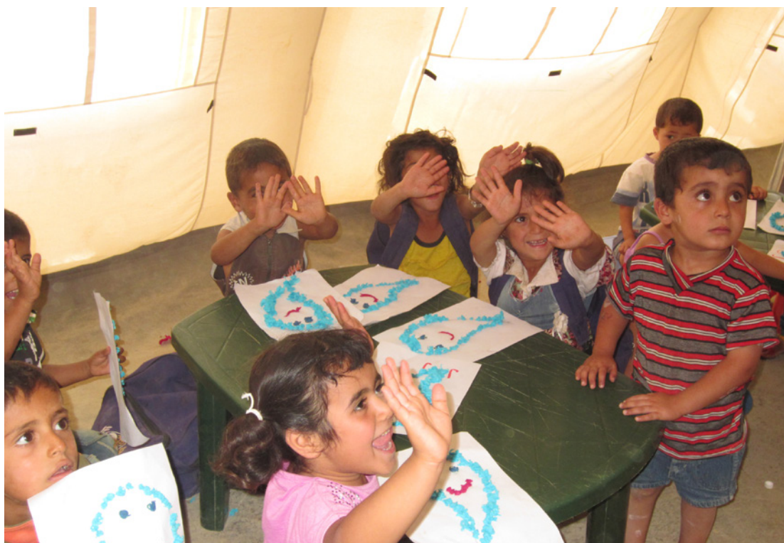
Children at school in refugee settlement, Lebanon

The evaluation found evidence that the Humanitarian Strategy remains relevant to the current humanitarian context. One indication is that, despite Danida granting its partners considerable flexibility in making programming decisions, in the comparative partner analysis, each organisation reported implementing a large number of the priorities (see Annex F). 12 The case studies also provided evidence of the relevance of the Strategy. For example, planning documents for the response to the Syria crisis reflect a number of the priorities, particularly the focus on vulnerability, protection, linking emergency and longer-term approaches, and the promotion of innovation. The focus on vulnerability has been relevant in Afghanistan, enabling Danida to combine longer-term assistance to refugees and internally displaced persons (IDPs) with emergency assistance to those affected by natural disasters and conflict. In addition, the initial broad consultations in preparation for the WHS have identified targeting assistance to the most vulnerable, resilience and respect for international humanitarian law as some of the critical issues to be addressed (see Section 3.4 in Annex D).