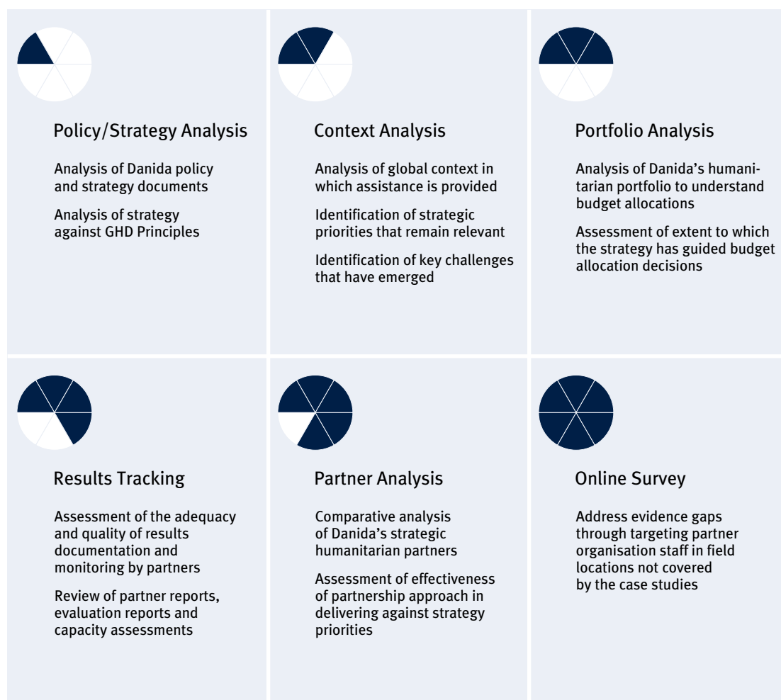
Figure 1: Methodological building blocks

The participatory and learning-focused approach described above was underpinned by a number of core methodological building blocks. Figure 1 below summarises these while Annex B describes each tool.