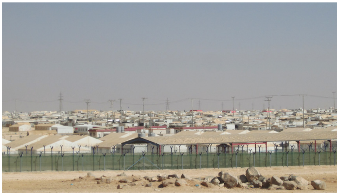
Za'atari Refugee Camp, Jordan

prioritised in 2014. 21 According to partners, in 2014, they were using Danida funding in 35 countries (including countries outside the priority crises where they were responding with flexible funds). 22