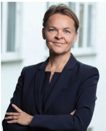
H.E. Hanne Fugl Eskjær

Denmark is cited as an example of system transformation, illustrating how structural reforms can strengthen the role of general practitioners, bring care closer to patients, and better integrate digital solutions into care pathways. In conclusion, the senator calls for strengthened cooperation between countries to share experiences, foster joint thinking, and build more efficient and resilient healthcare systems.