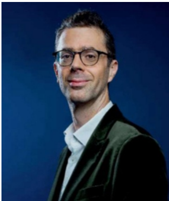
Nicolas Bouzou ECONOMIST, PRESIDENT OF ASTERÈS

The study of the medical and socio-economic costs of seven chronic diseases in France, presented by Nicolas Bouzou, highlights that the burden of chronic diseases extends beyond the healthcare system alone, affecting the economy and society more broadly. It is based on an approach focused on the most robust tangible costs, including medical expenses, absenteeism, deaths among working-age individuals, and exclusion from employment.