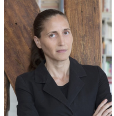
Cynthia Fleury PHILOSOPHER

It highlights that the progression of chronic diseases implies a paradigm shift, with a move from a treatment-based approach to one based on prevention, monitoring and long-term support.