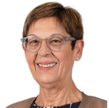
Chantal Deseyne SENATOR FOR EURE-ET-LOIR

Senator Chantal Deseyne opened the conference with a clear observation: the challenges related to chronic diseases are both significant and shared by France and Denmark. Faced with increasing pressure on healthcare systems – whether medical, financial, or human – she emphasized the need for a paradigm shift, placing prevention more firmly at the heart of health policies.