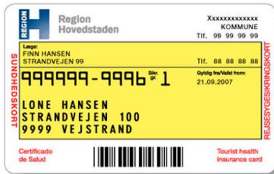
The Special Health Insurance Card: